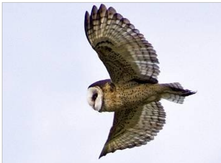
Jane's Grass Owl

Our highlight of this visit was without doubt the siting of an African Grass Owl. Jane Smart, at long last took the most amazing pictures of this swerving Grass Owl, as well as a couple of pictures of the very special red data listed, Broad-tailed Warbler. If one dares to climb out to the top of the resort, you will find open rolling grasslands, with beautiful wildflowers amongst seepage wetlands. This is where I have found a covey of Grey-winged Francolin for the first time on Verlorenkloof.