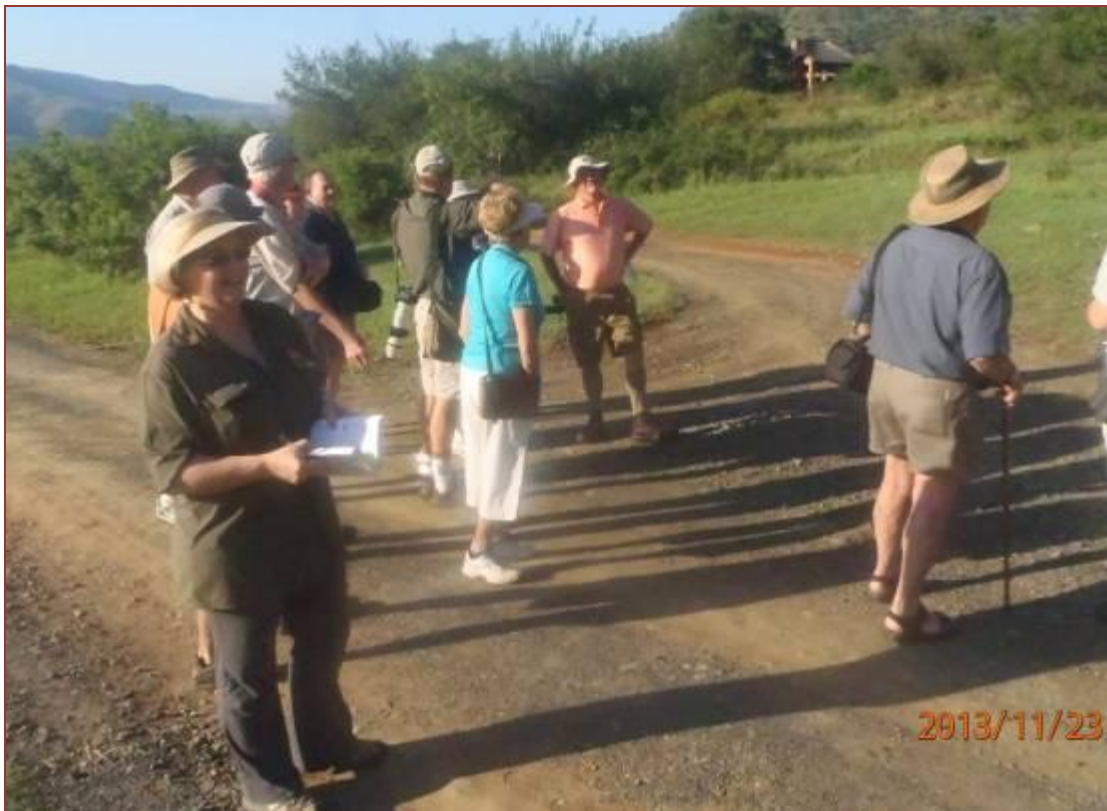
Ha ha , I love it when a plan comes together. Verlorenkloof a special place with a great variety of birds that attracts a great diversity of people.