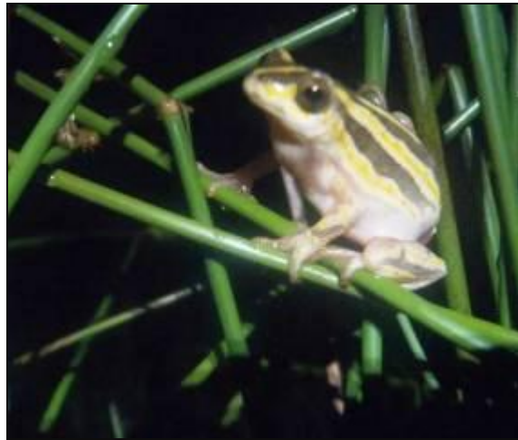
They quack by night." Die mannetjies padda soek sy nooi, in die vlei, haham".