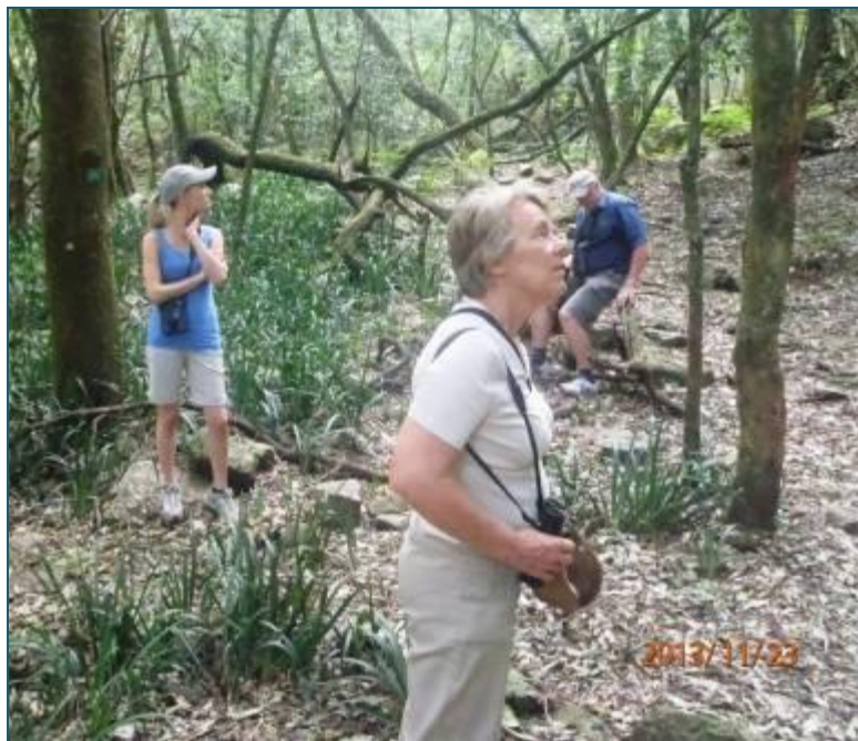
This is getting very boring, I wish we can go back now.