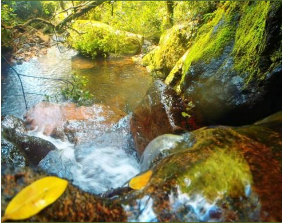
Cool and sweet drinking water.