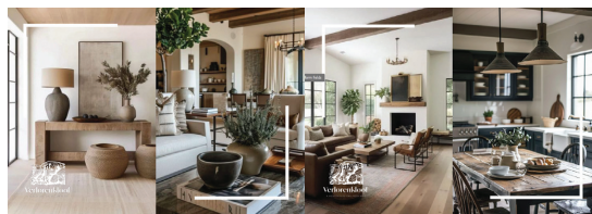
INTERIOR DESIGN INSPIRATION